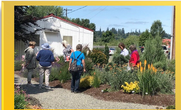
PUYALLUP DEMONSTRATION GARDEN

On the north side of the WSU Puyallup Research and Extension Center, the