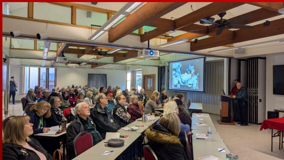
A CONTINUING EDUCATION CLASS FOR MASTER GARDENERS

To educate the public on all the best and latest scientific information, our Master Gardeners participate in ongoing education through classes, workshops and conferences from industry experts.